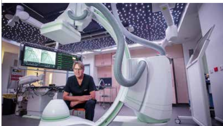
Image Guided Healthcare